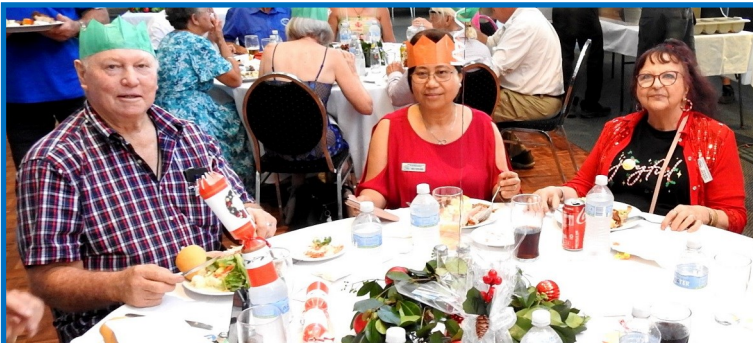
Happy smiling faces of VAA members enjoying an excellent Christmas Event