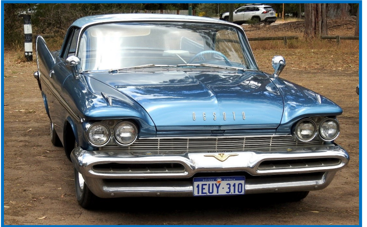
A very small selection of the Blue cars on display