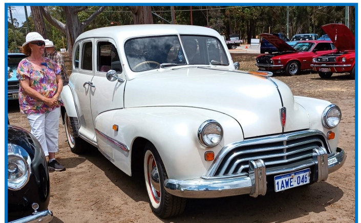
1946 Oldsmobile - Owner Sue Fletcher